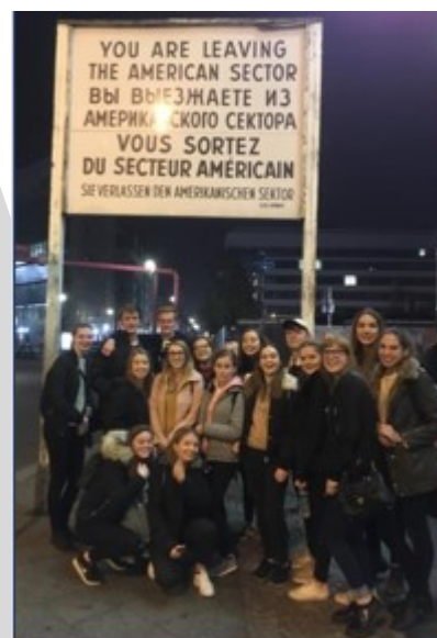
A Level History students, Berlin 2017

As a student, your Sixth Form years offer greater freedom and opportunity, but along with this freedom comes more responsibility. It is a time for you to take control of your own destiny; an exciting time when you will make big decisions as you prepare for higher education, employment and your future career.